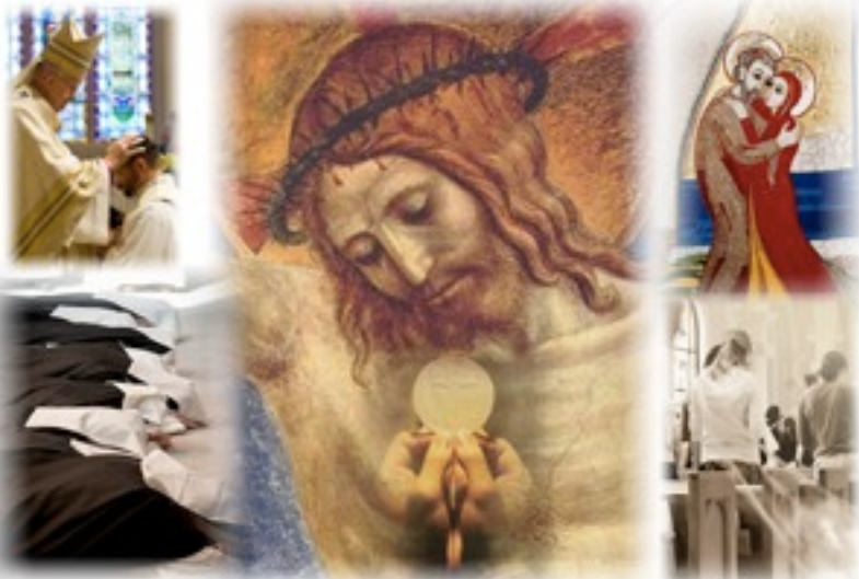
Marriage & Consecrated Life